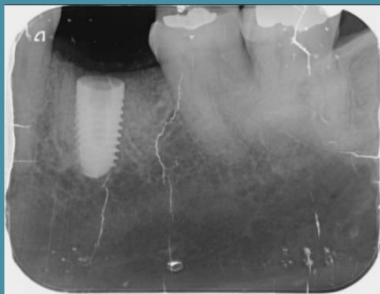
Periapical x-ray scan After extraction and bone grafting

By: Doctors at the Clinic for Oral and Maxillofacial Surgery, Shamir Medical Center