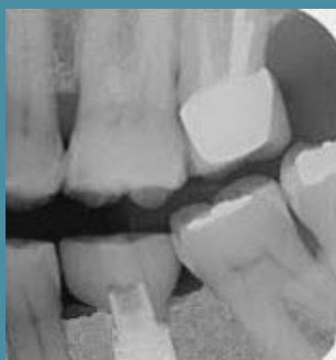
Periapical x-ray scan 4 years post grafting - with crowns