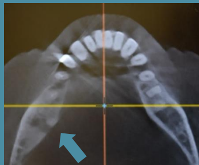
6 months following bone grafting: Axial and Sagittal planes