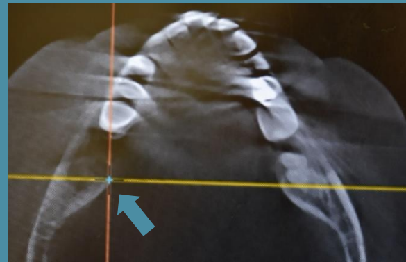
CBCT scan: Axial