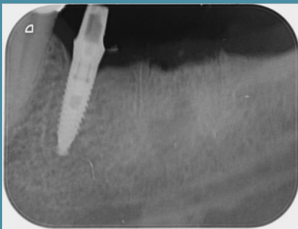
Periapical x-ray scan After extraction and bone grafting

By: Doctors at the Clinic for Oral and Maxillofacial Surgery, Shamir Medical Center