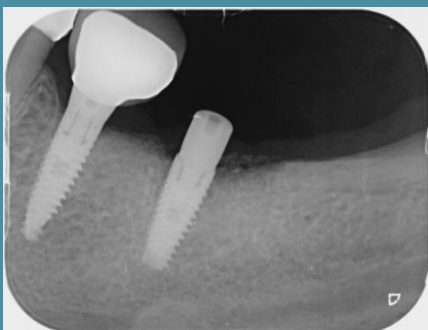
Periapical x-ray scan 6 months post grafting another implant placement