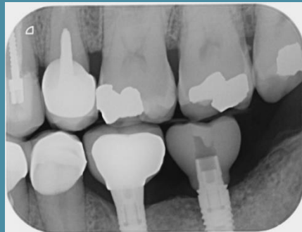
Periapical x-ray scan 4 years post grafting - with crowns